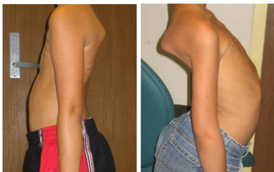
Lordosis occurs due to weakness in the abdominal muscles, particularly the lower abdominals. 3

NOTE: Additional information about the characteristics, prevalence, inheritance, and typical symptom progression in FSHD are available in the publications listed in the “Additional Resources” section.